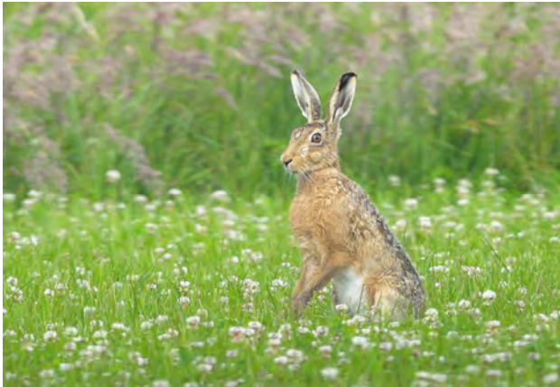
Living in Clover Tina Townend